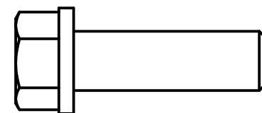
Item 3: 7/16" UNF x 1 1/2" Hex Bolt and Spring Washer